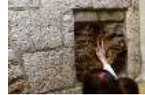
Via Dolorosa, Jerusalem. Israel.