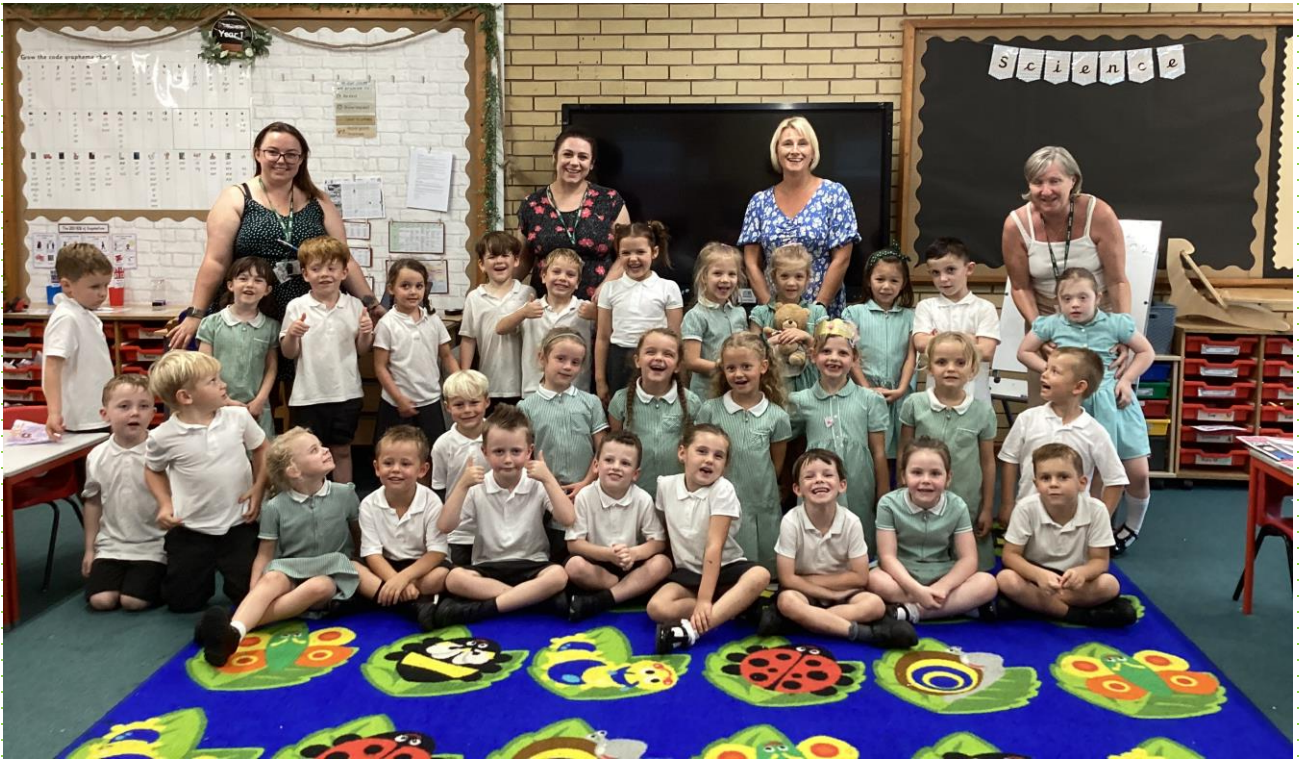
A hot and sticky picture taken at the end of a successful first week in Year 1!