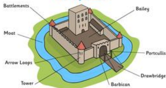
Parts of a Castle

When the rebellion against King William calmed down they were able to build Keep and Bailey castles, which took longer to build and were made out of stone. Some of them are still around today, including Windsor Castle and the Tower of London.